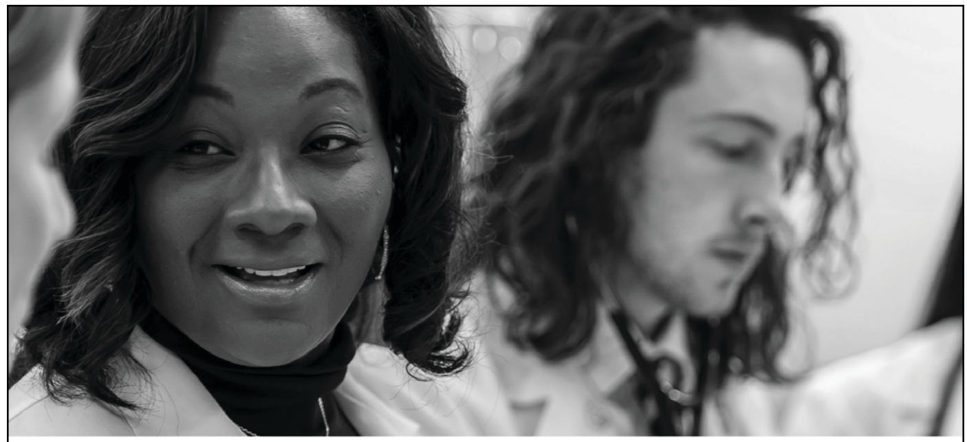
Enhance your practice, improve population health, and increase your capacity for training future health professionals