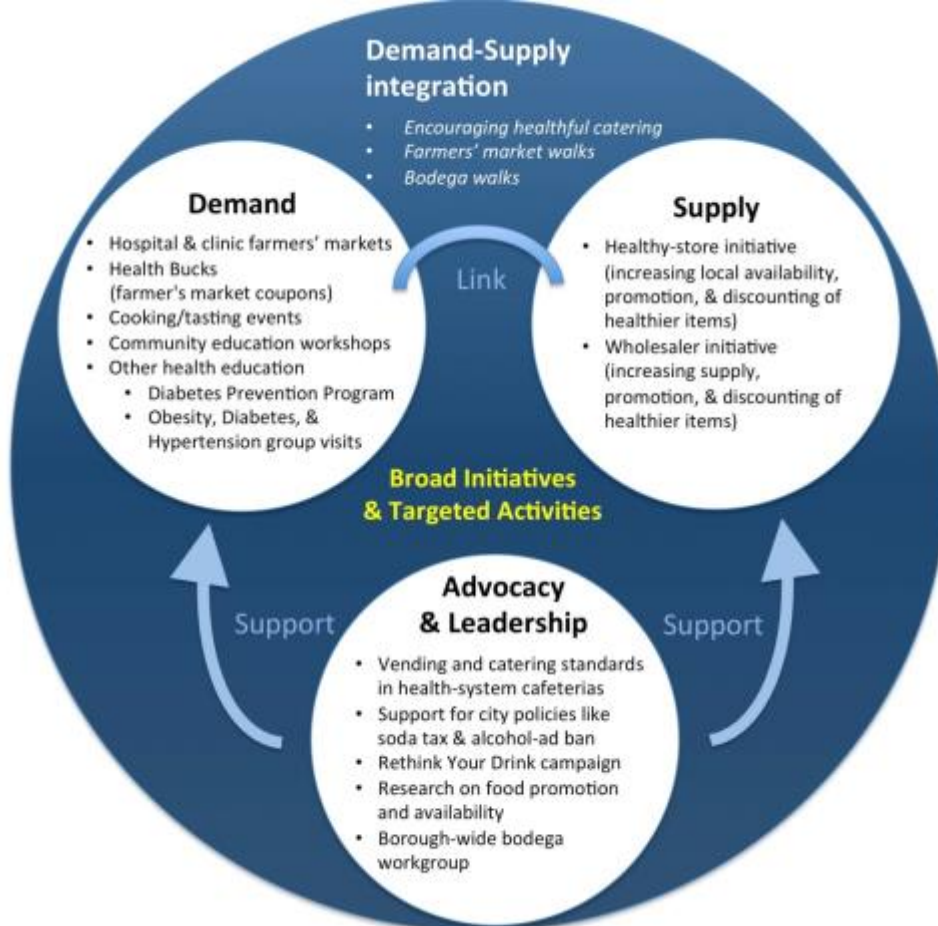
Figure 1. An integrated 3-pronged strategy to promote healthier foods, healthier eating, & improved health.